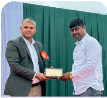
Maxwell Hospitality Service - Canteen Agency