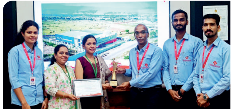
"Astech Calibration Services Pvt. Ltd." for Best Calibration Service