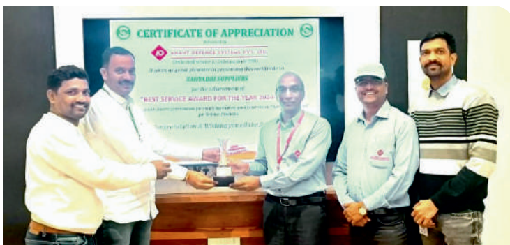
Best Transport Service "Sahyadri Suppliers"