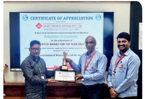
Best OD-ID Grinding Services by "Shraddha Enterprises"