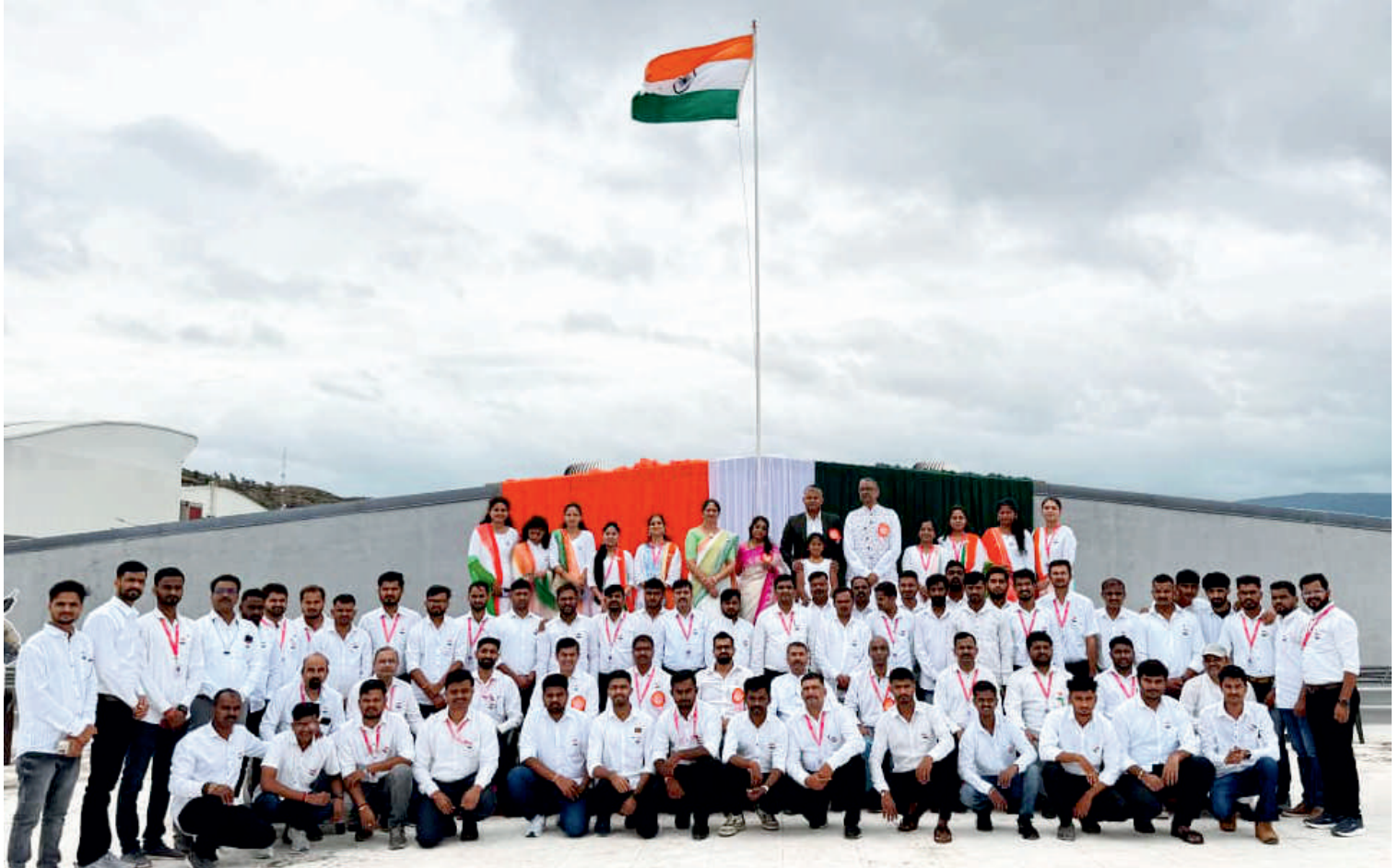
Independence Day & 37th Company Anniversary Celebrations

Our Director shared his inspiring vision — to transform Anant Defence Systems into a ₹ 500 Cr Defence OEM company , reaffirming our commitment to innovation, excellence, and nation-building.