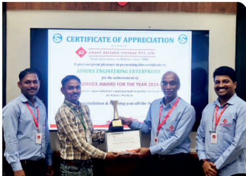
Best Wire cut & m/c Services by "Adhira Engineering Enterprises"