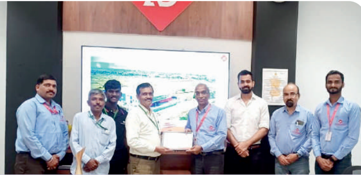
Best Material Testing Service by "Sadhana NDT Services Pvt. Ltd."

Our various outstanding service providers are awarded for delivering exceptional quality service in 2024-25, setting a high standard for excellence and customer satisfaction.