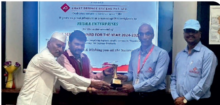
Best Powder Coating & Lacquering Service "Rudra Enterprises"