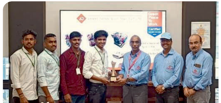
Best Radiography Testing Service "Alhak Quality Inspection Services Pvt. Ltd."