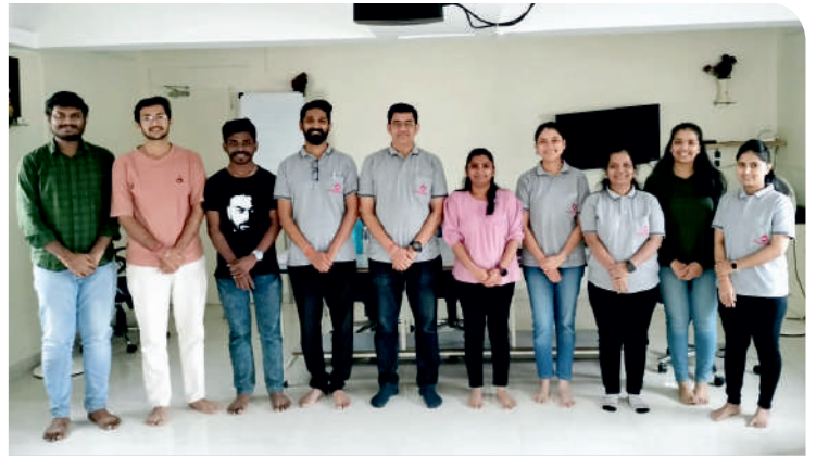
Aug. 16, 2025: The Rising Star Batch-5, Session-4 on. “Think 5B,” was conducted by CJD Sir at Pragati Terrace Hall, Kothrud Pune.