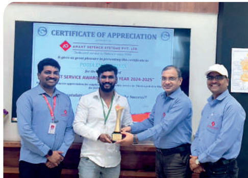
Best Electro Polish & Coating Services by "Pooja Enterprises"